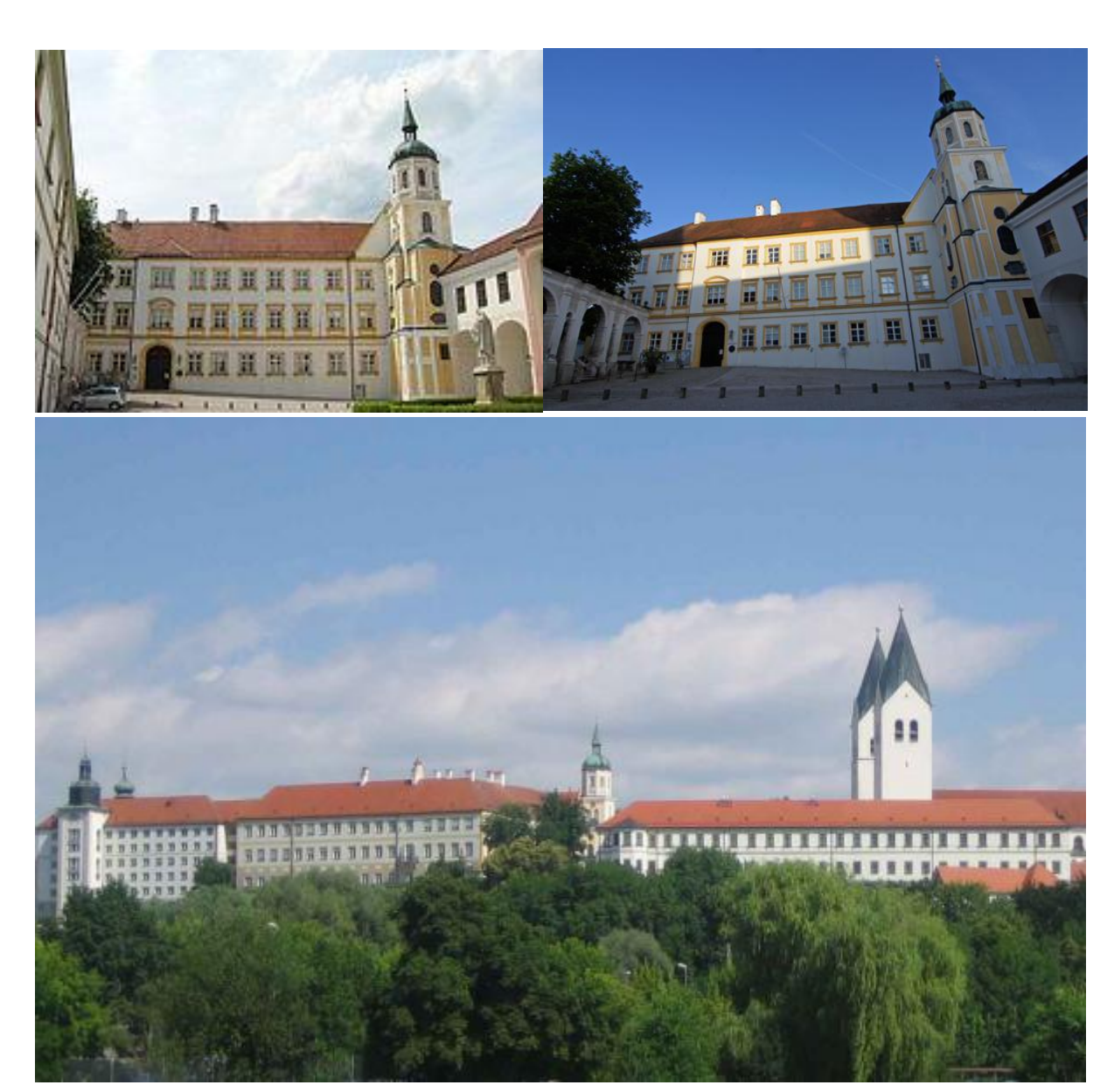
Figure 3: Kardinal-Döpfner-Haus