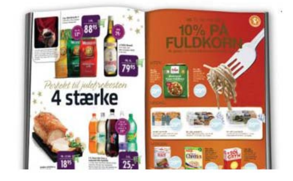
Fig. 3. An example of whole grain advertising

Whole Grain May 2012. Branded material was available for all partners to recommend to the consumers that you can eat whole grain for breakfast, lunch, and dinner. Free recipe books in retail stores, gas stations, and health organizations counseling centers. The goal of this campaign was to increase logo