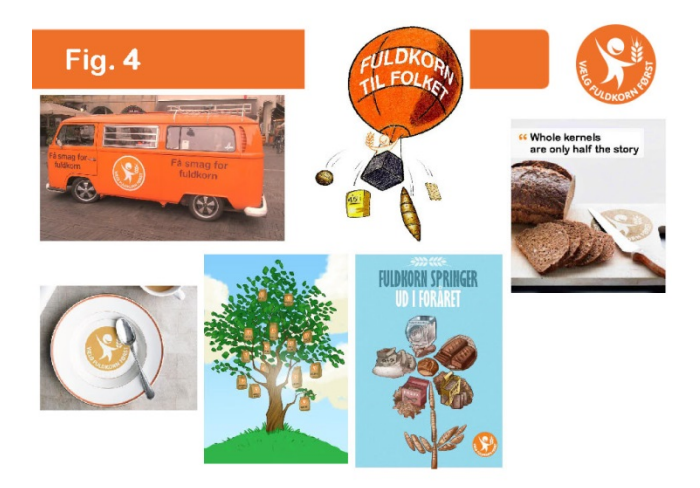
Fig. 4. Examples of Whole Grain Campaign events