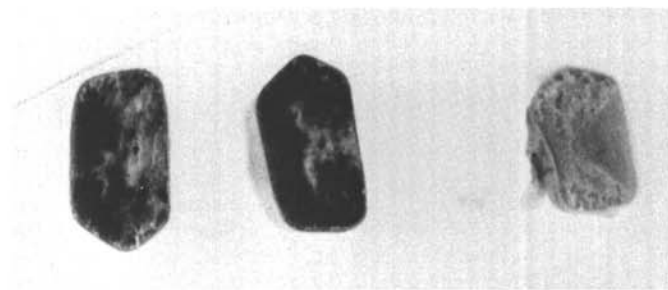
Fig. 3. Cross-sectional cuts of a corn kernel exposed to sulfur dioxide for 60 sec prior to being sliced and stained with iodine. From left to right are sections through the top, through the middle, and through the bottom of the kernel. Photo taken 3 min after iodine was applied.

can be observed. This rate of lightening of the kernel can serve as only a rough qualitative measure of the direction and magnitude of diffusion occurring within the kernel, because the slicing of the kernel has modified gradients within the kernel and may allow for other transfer mechanisms to become important. A secondary reaction with iodine also occurs that causes it to lose its color with time, as can be observed in the untreated kernel. The area near the center of the kernel by the germ lightened with time, as can be seen in Figure 1C. This reaction is considerably slower than the change observed from diffusion.